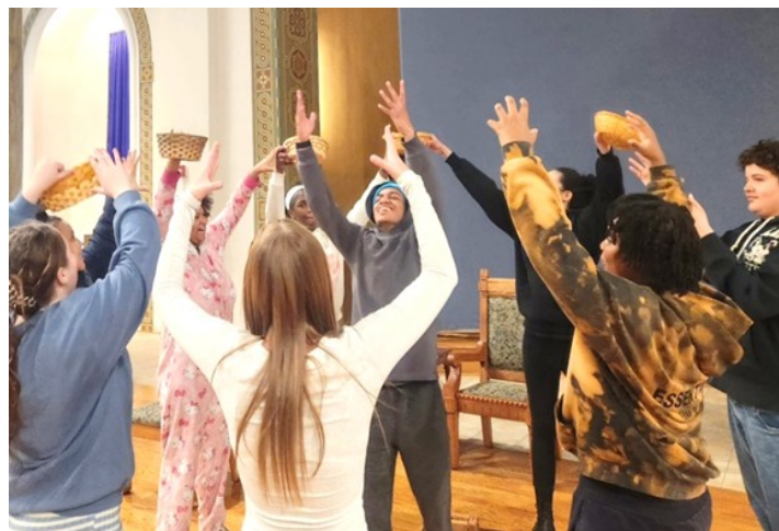
The youth of St. Monica, Immaculate Conception/St. Bridget, and Emmanuel Church of the Deaf tell the story of Jesus' life, death, and resurrection in the Passion of Jesus Palm Sunday play.

Easter Sunday Mass: April 5 10:00 am @ St. Monica Church followed by Easter Egg Hunt All are welcome, especially you!