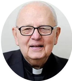
Celebrated Mass on Sundays for over 10 years at Immaculate Conception/St. Bridget's